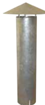
“The Coolie” (Type A)