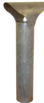
Hinged (Type B)