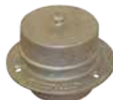
Deck Flange & cap, Galvanised