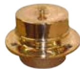
Deck Flange & cap, Bronze

approx 18” Galvanised steel with a choice of two top fittings